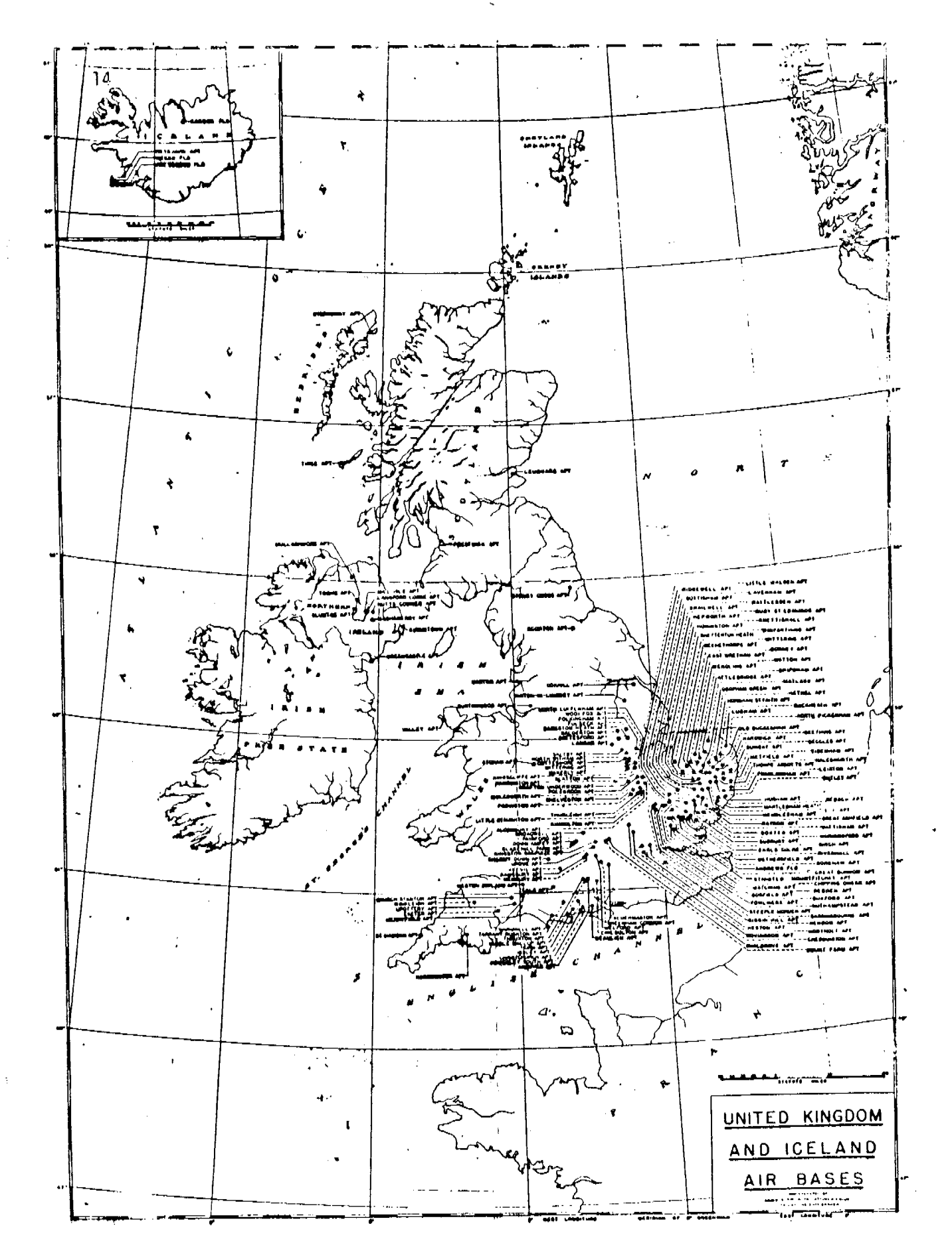
Fig. 2. Flying facilities, 1945